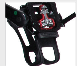
Dual-Clip Foot Pedal