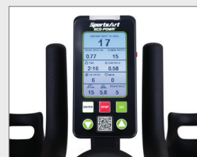
LCD Digital Display