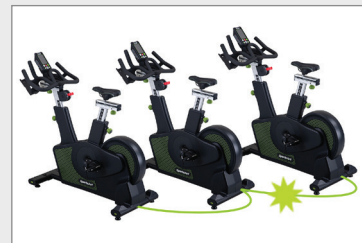
Connect Multiple Units